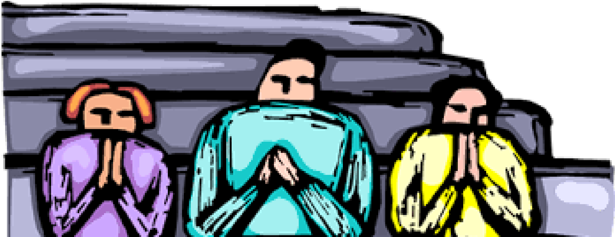
Meeting together in Alert Level 2