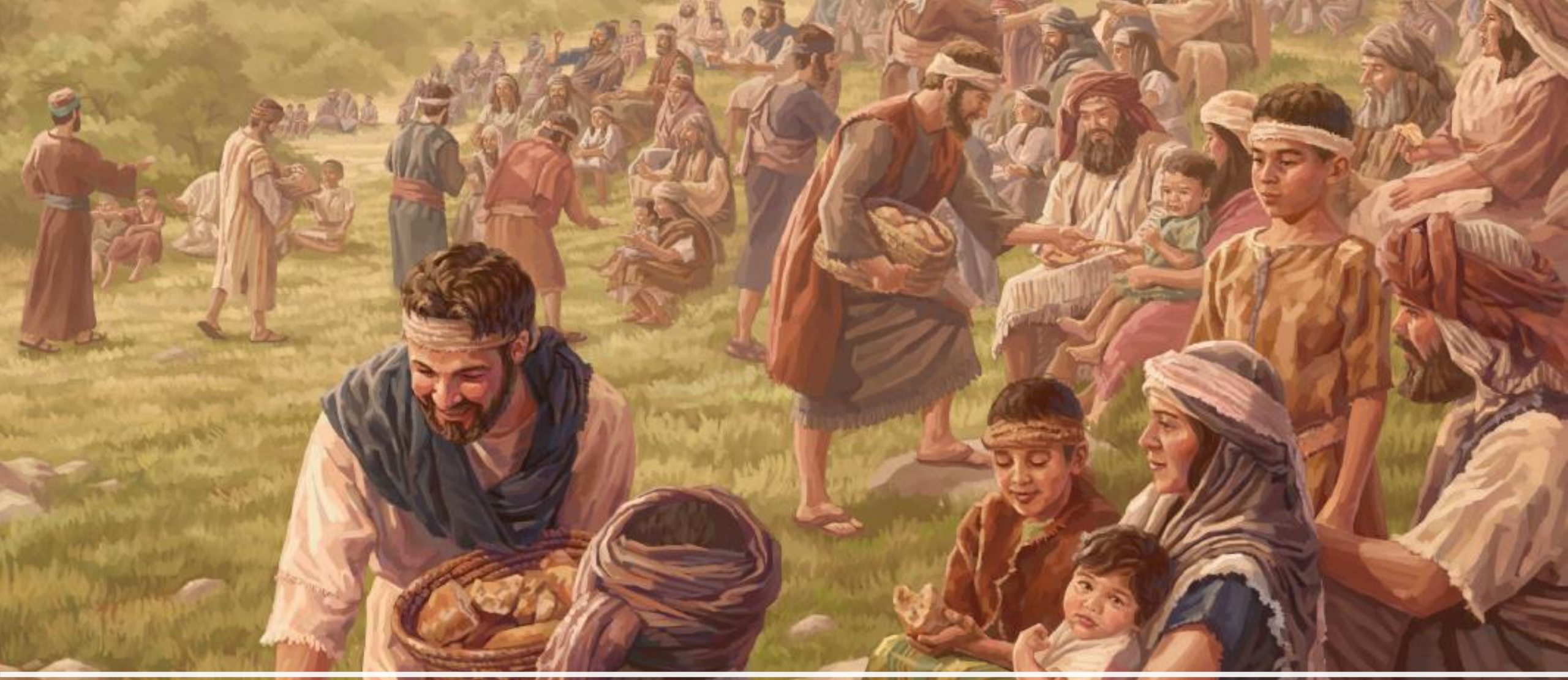
Feeding the 5000