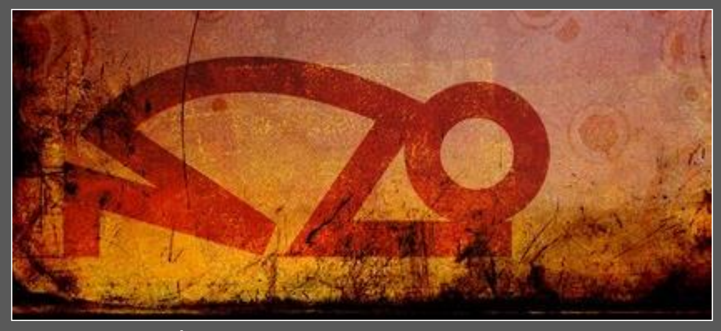
Welcome to pre-service prayer