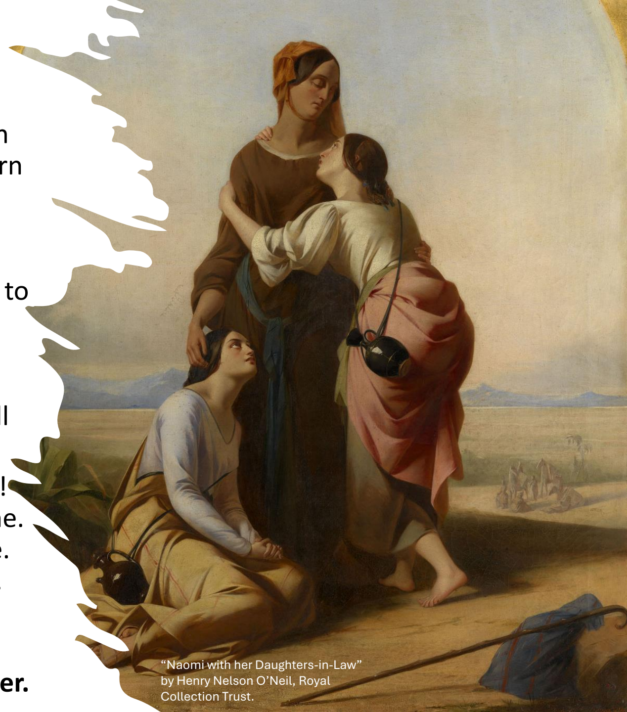
“Naomi with her Daughters-in-Law” by Henry Nelson O’Neil, Royal Collection Trust.

14 Again they wept loudly. Then Orpah kissed her mother-in-law goodbye, but Ruth clung tightly to her.